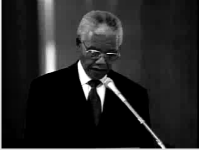
(click above to play)