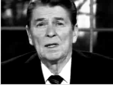
(click above to play)