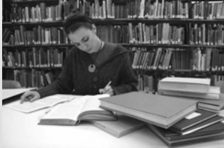
The McGraw-Hill Companies © 2009 Stephen E. Lucas. All rights reserved.

Work that synthesizes large amount of related information